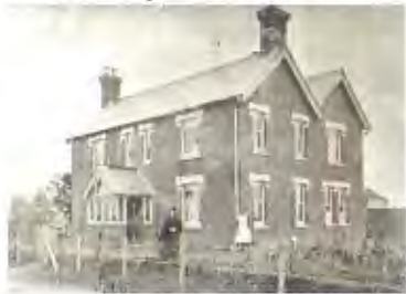
Highcliffe c 1900

Hickman's Corn merchants operated here during the early 20th Century until 1947.